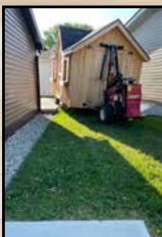
Mule moving a buiding.

Built on Site Fee Included $7,500.00 Built onto your Concrete Slab. Priced with no railing.