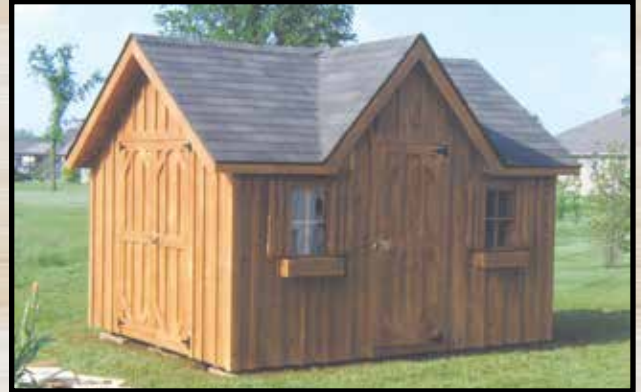
8'x12' SUPER SHED $3,950.00