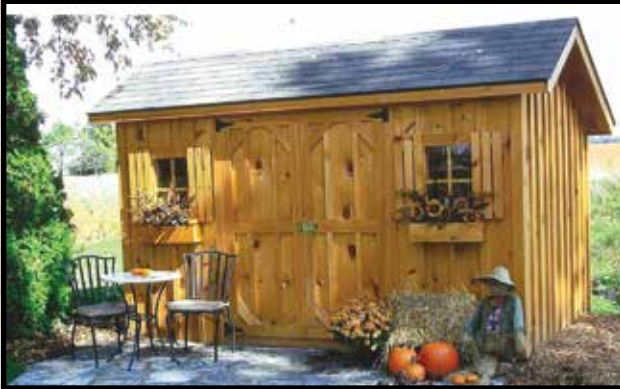
8'x12' GENERAL SHED $3,500.00