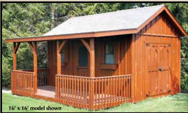
16' x 16' model shown