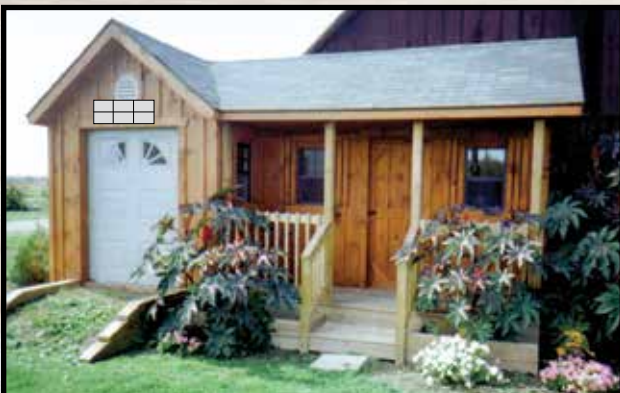
12'x20' GARAGE/PLAYHOUSE COMBO $8,000.00

Optimal Size 8'x8' $2825.00 Plexiglass Windows Included.