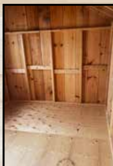
Interior of our buildings.