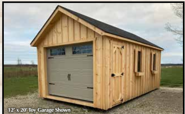
12' x 20' Toy Garage Shown

*You are welcome to source your own roll-up door.